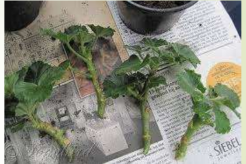
Geranium cuttings (sardinella)